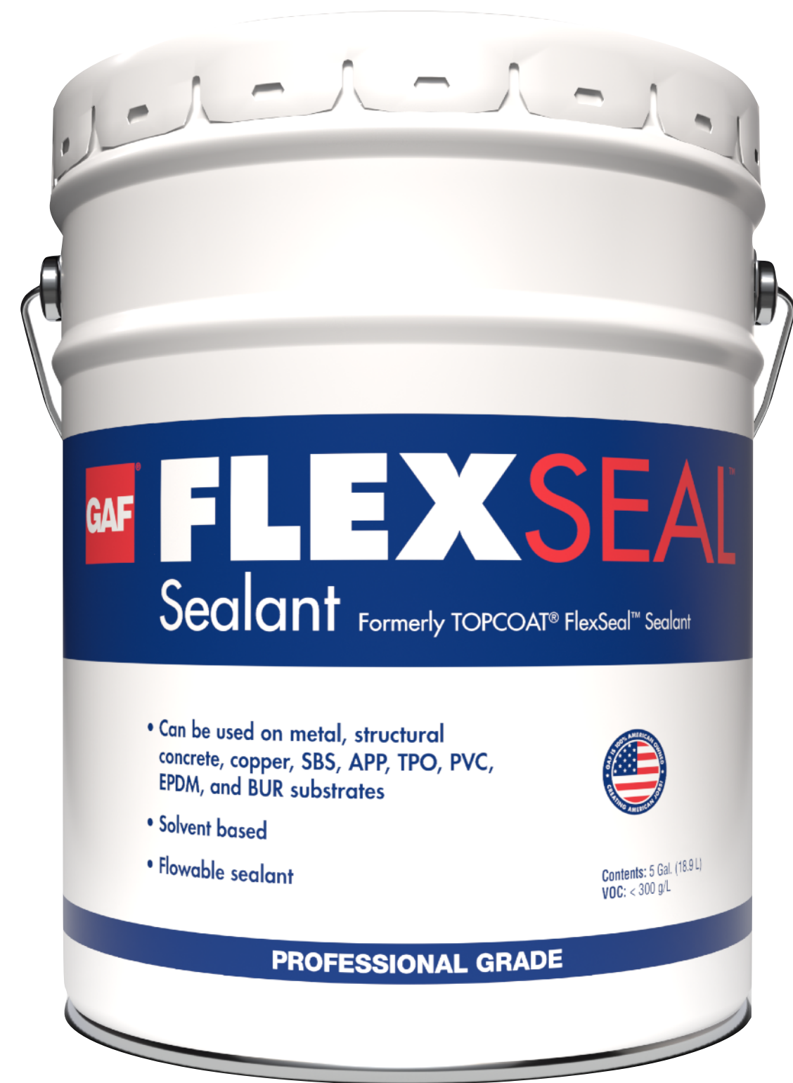
8941920 - FlexSeal Sealant White 5 GAL White