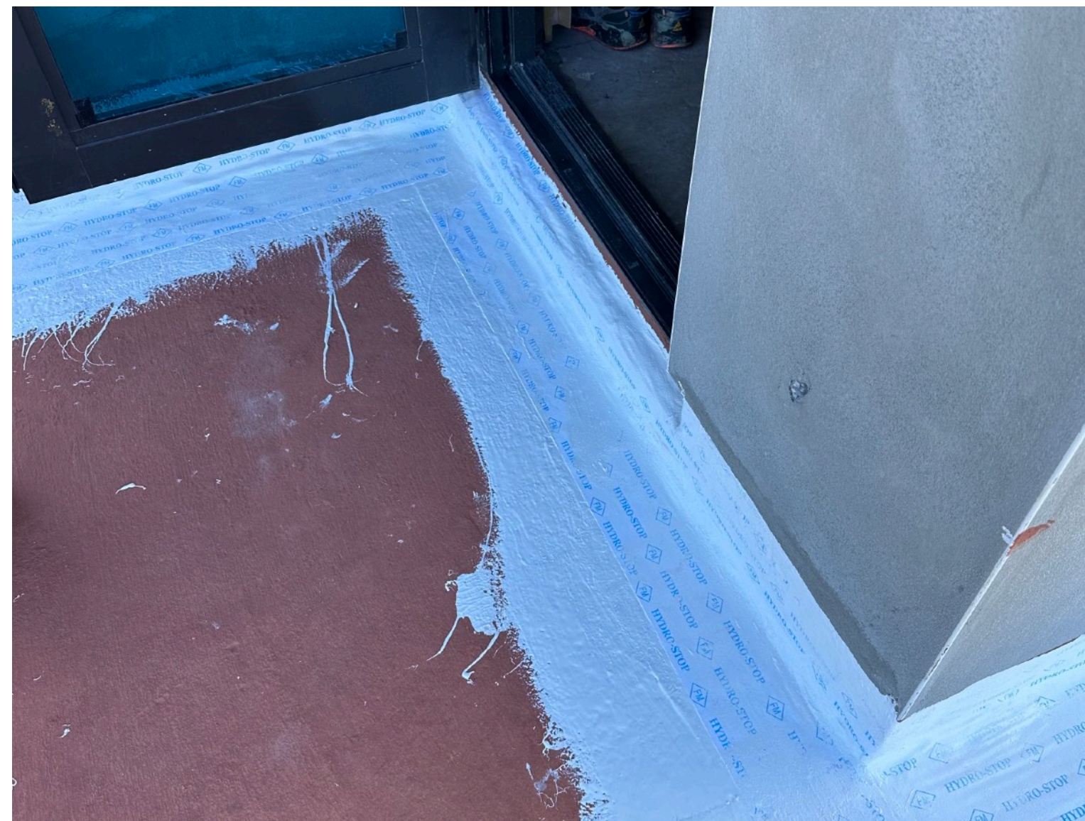
Fabric Reinforced Flashing Details