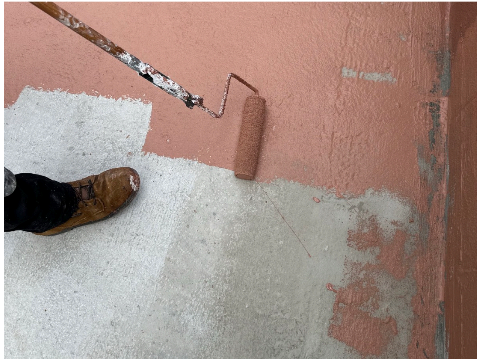
Prime Concrete Deck GAF Multi Purpose Primer

Miami-Dade NOA# 23-1130.05 - page 13 of 14