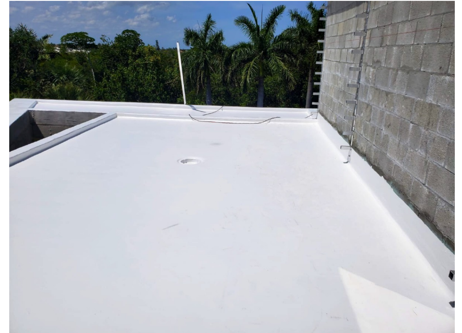
Surface Seal SB Application